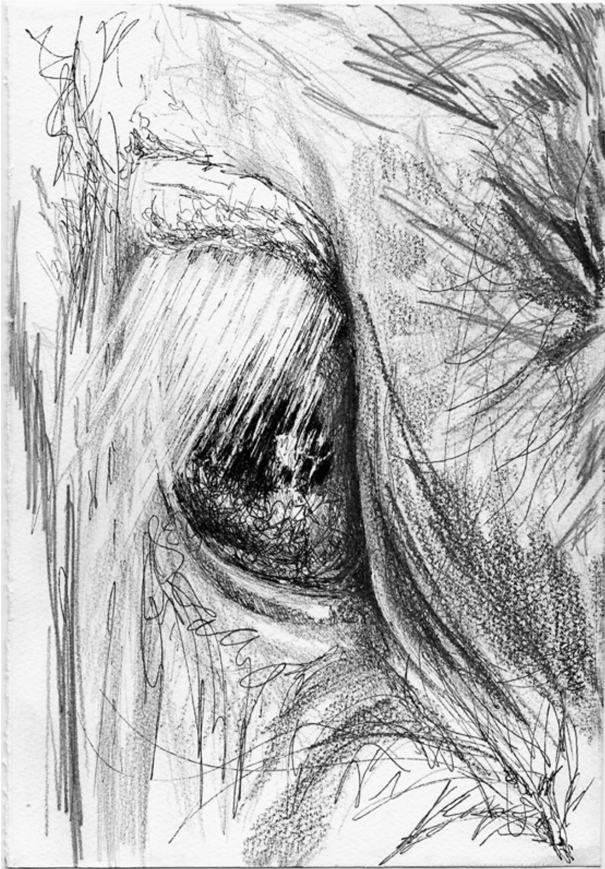
El toro Santiago (Tame) en su vida normal, en una finca de la comarca de Osona, Barcelona (cargo de la Fundació Altarriba), febrero 2012 2018, graphite and ink on cotton paper, cm. 27,8 x 19,2 courtesy of aA29 Project Room, Milano/Caserta