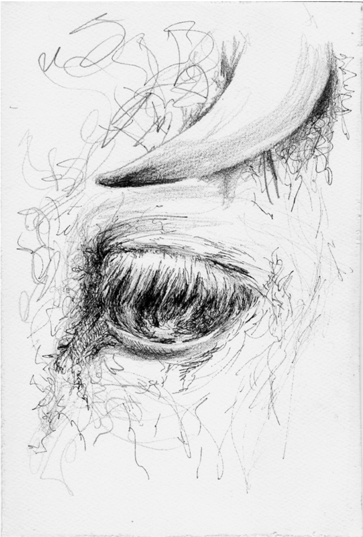
El toro Santiago (Tame) en su vida normal, en una finca de la comarca de Osona, Barcelona (cargo de la Fundación Altarriba), febrero 2012 2018, graphite and ink on cotton paper, cm. 27,8 x 19,2.