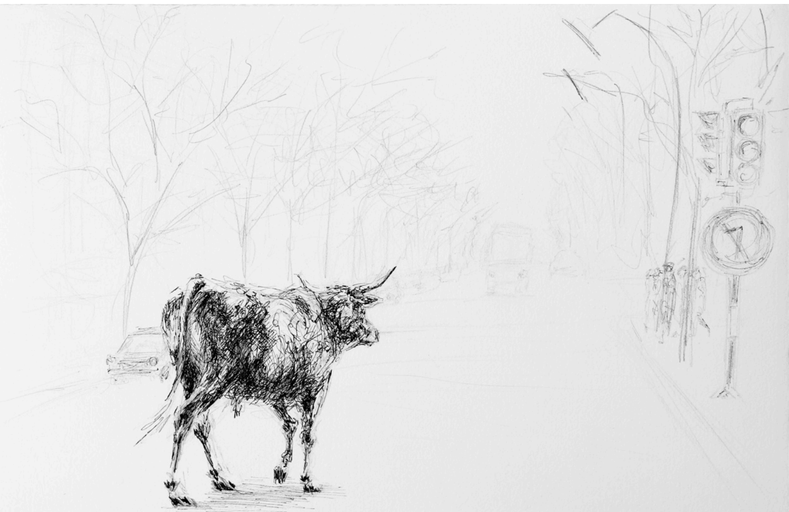
Novillo que saltò la barrera, in paseo por el Barrio de Salamanca, Madrid 29 de mayo 1955 2018, graphite and ink on cotton paper, cm. 28,2 x 38,6.