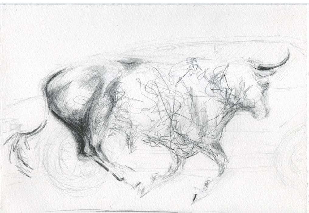
Toro se escapa en Talavera de la Reina y provoca once heridos 15/05/2015 2018, graphite and ink on cotton paper, cm. 19,2 x 27,8.