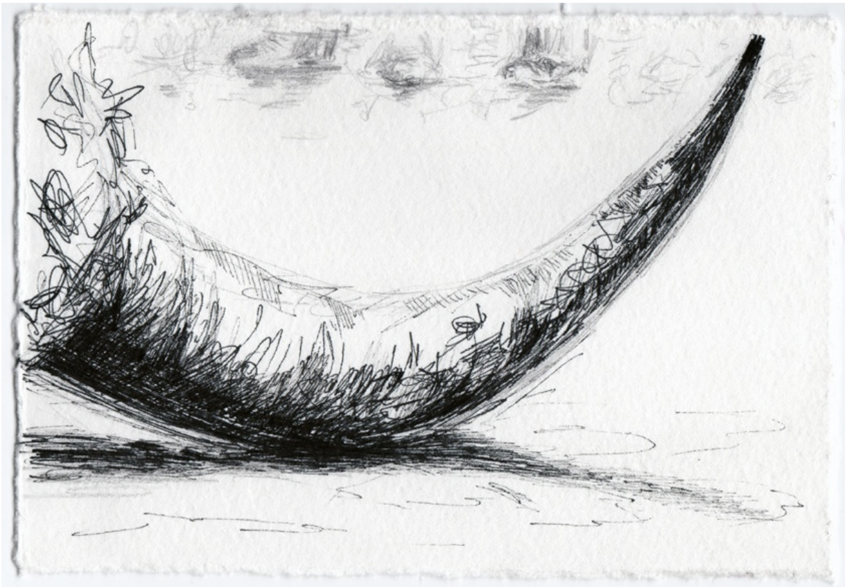
cuerno: ANGELO, Madrid, 1928: la famosa fuga, lidia y muerte de un toro en la Gran Vía 2018, graphite and ink on cotton paper, cm. 9,6 x 14