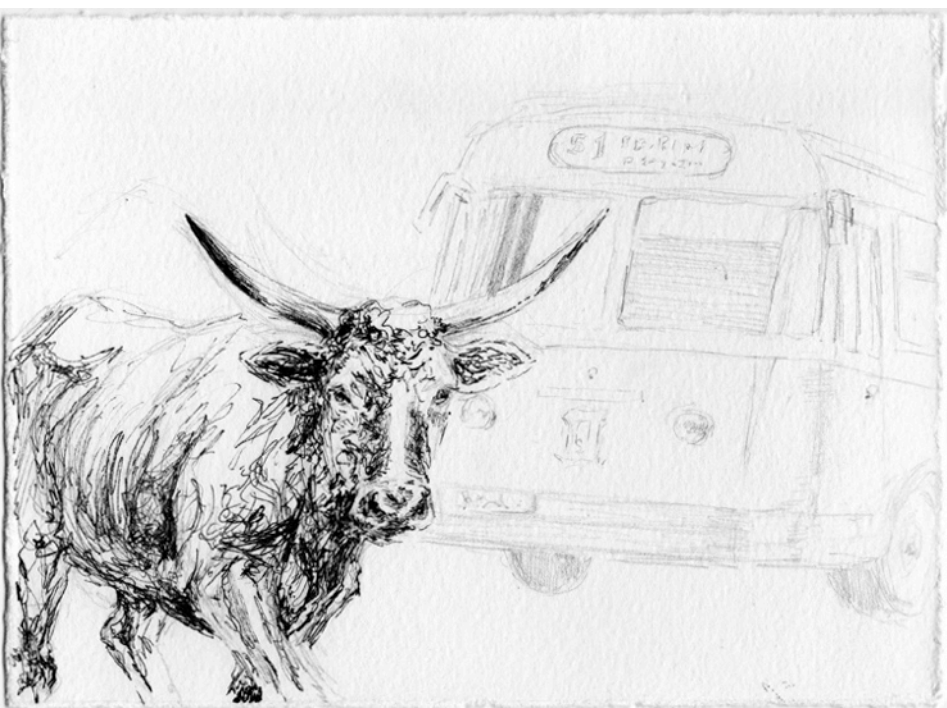
Toro escapado de la plaza de toros, 1955, Madrid 2018, graphite and ink on cotton paper, cm.14 x 18,9.